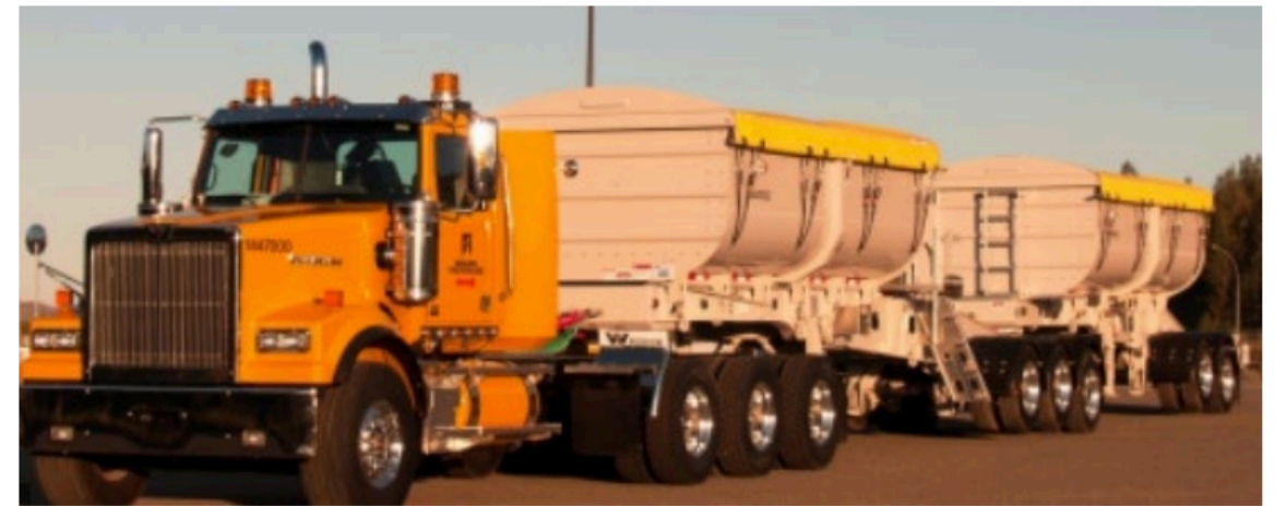
Image of On-Highway Truck Proposed